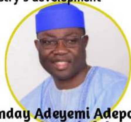
Hon. Sunday Adeyemi Adepoju Postmaster General of the Federation /CEO, NIPOST

as you continue to serve our dear country.