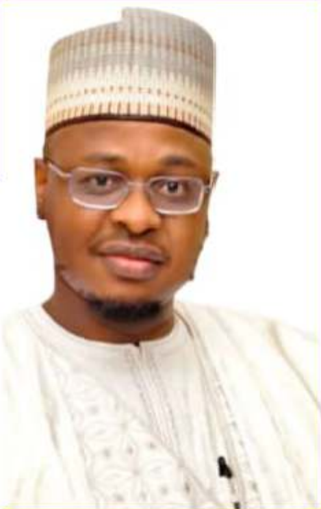
Prof. Isa Ali Ibrahim (Pantami) Hon. Minister of Communications and Digital Economy

H appy birthday and congratulations on attaining the golden milestone of 50. Today, your giant strides and track records as the Honourable Minister of Communications and Digital Economy cannot be wished away, particularly, in the Nigerian Postal Service (NIPOST), one of the parastatals under your supervision. We are proud of you!