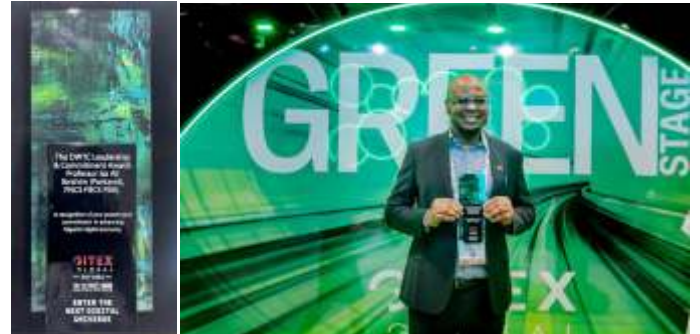
Pantami: Honoured abroad with Leadership and Commitment Award at the GITEX GLOBAL, Dubai, UAE

When in September of 2016, the then Dr Isa Ali Ibrahim (Pantami) heeded the clarion call, packed his bags and bade a very lucrative academic career in one of the most illustrious institutions good bye, not a few wondered in disbelief. His first appointment in public service as Director General of the National Information Technology Development Agency (NITDA), plunged him right into the middle of a complex, disorganised, monolithic and corrupt sector, grappling with the lacuna of professionalism and leadership. Again, not many gave him a chance. Unprofessionalism and a total deviation from lawful standards had become so common place, nobody expected the much-needed remedy would come in the form of an unassuming, humble and “new” young man. But he took the Agency, sector and the nation by surprise and within months, repositioned the Agency in every ramification and set it on a steady course of exemplary success. NITDA has continued to thrive on the solid foundations laid by Professor Pantami.