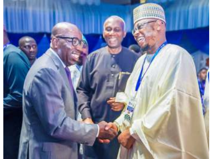
Pantami with Governor of Edo State, Godwin Obaseki; and Chairman of MTN Nigeria, Ernest Ndukwe at a recent function to stakeholders accelerate broadband penetration.